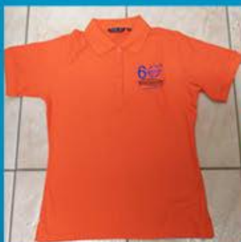
Polo - Shirts Male and Female Sizes: Small, Medium, Large, 1XL, 2XL, 3XL $1,385