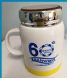
Ceramic Mug with secure lids $850