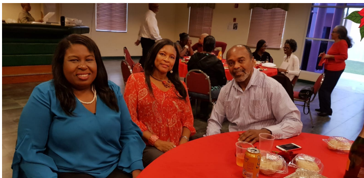
WIGUT (Jamaica) members in The Bahamas celebrating Christmas 2018.